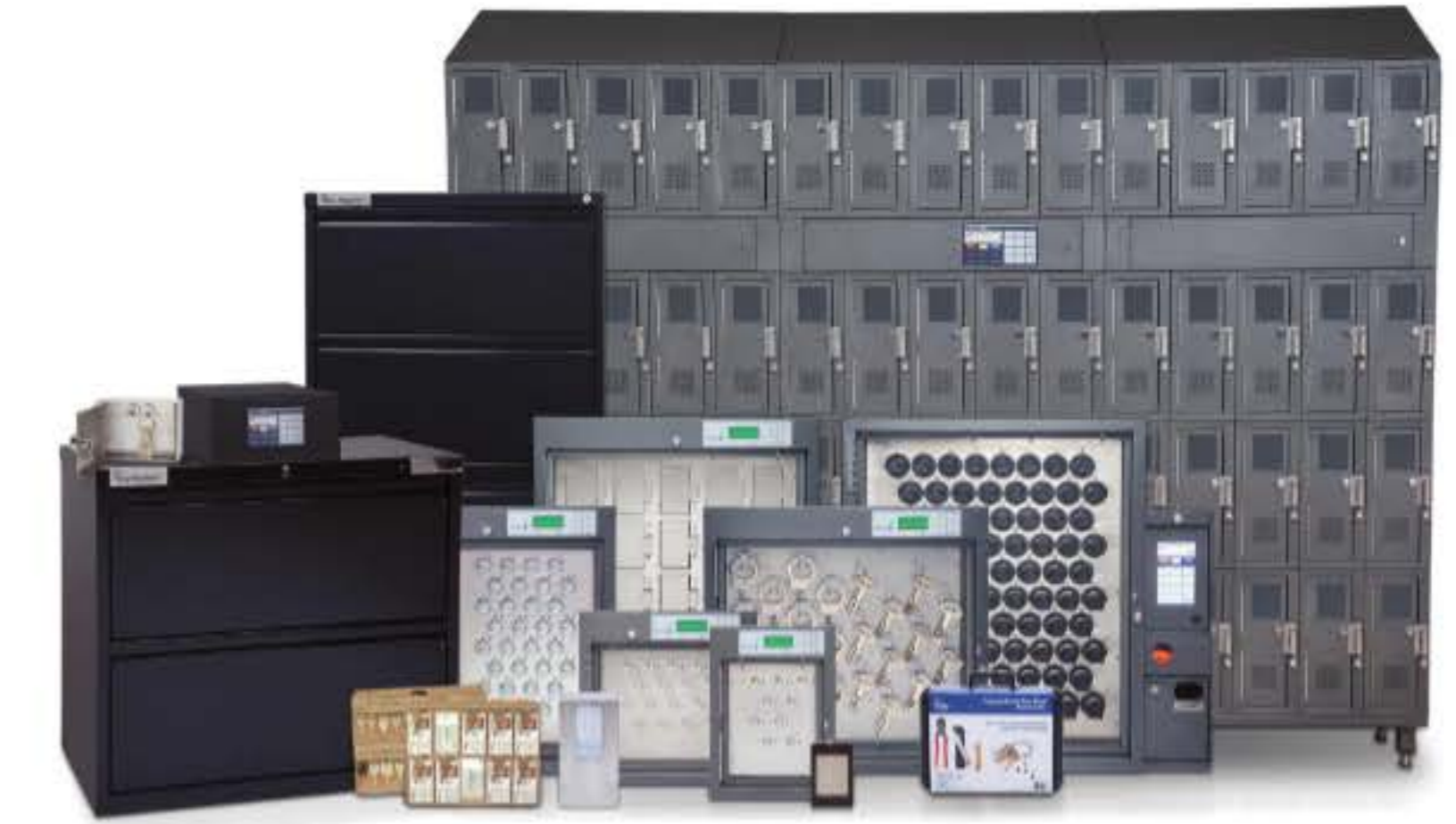
KSI's family of products offers solutions to secure and monitor assets such as keys, OC spray, weapons and radios. All key boxes, lockers and OC cabinets can be controlled from one central system.

System alerts, which can be in the form of an audible alarm, an on-screen alert, or an email noti-